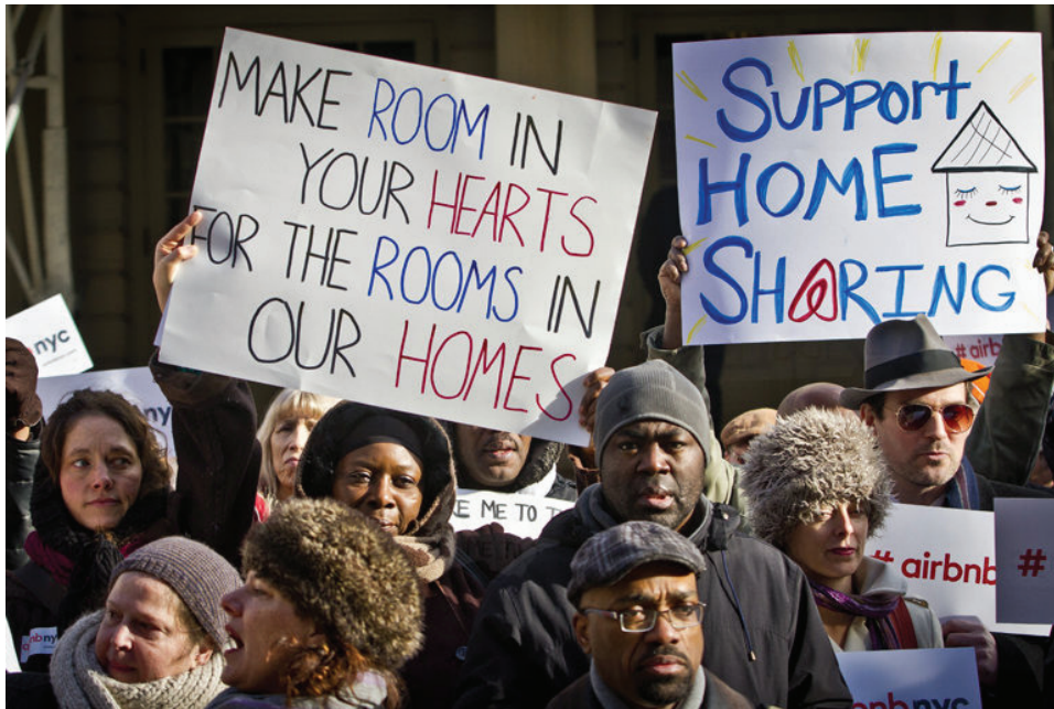
Airbnb advocates rallying outside City Hall in New York City.